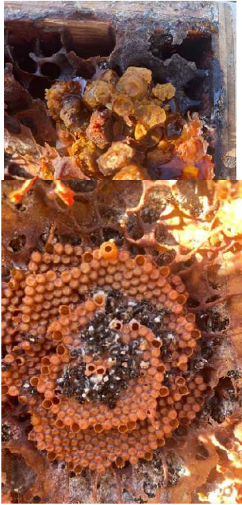
Left and Right. Close-up of full storage pollen and honey pots surrounded by black hard set resin with dead bees inside.