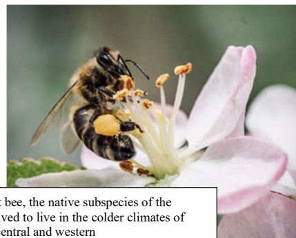
The European dark bee, the native subspecies of the honeybee, has evolved to live in the colder climates of parts of northern, central and western Europe.

The difference between farming dark bees and hybrid, or cross-bred, honeybees is like looking after a Scottish highland cow versus an intensive dairy cow, says Hubert Guerriat, a Belgian beekeeper and biologist who has been working with dark bees for 40 years and has been pivotal in driving the species’ return. “They are not the same animal.” Nature is like a high-precision watch. You can’t swap in one bee for another. Pollinators are not interchangeable