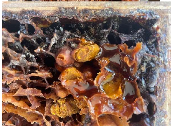
Full brood and stores. Black, hard set Cadaghi (?) resin on outside of nest.