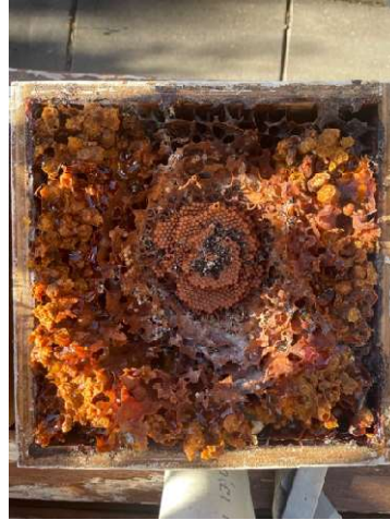
Below. Brood spiral with dead bees, and 500 gm of pollen rich honey