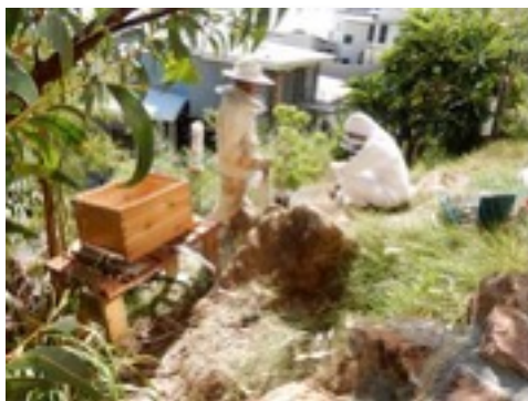
Above and Right: Cristi M getting help to transfer frames and bees from the starter nuc over to the Flow Hive brood box.