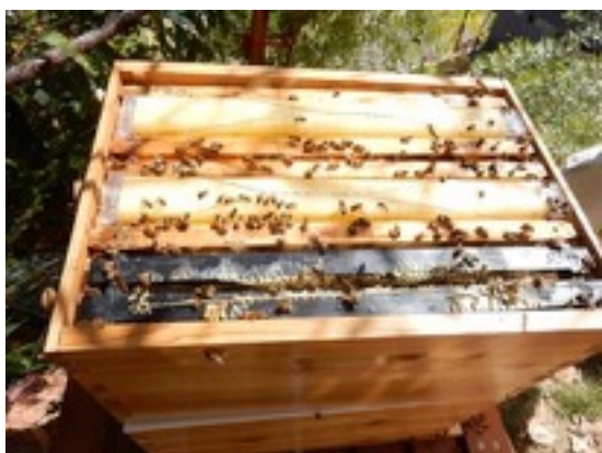
Left: Gradually introducing new blank Flow Hive frames that were pre-washed, rinsed and pre waxed into the Flow super in between drawn and filled honey frames from the nuc box. Notice there is a Flow frame with established drawn frames and bees on either side to encourage migration to the new frames. Progress has been slow, but has picked up recently with empty Flow cells filling up with nectar and a crescent of new caps on cells.