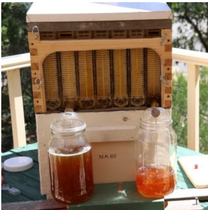
The Flow Hive has an inbuilt honey extractor.

"They won't change in a hurry, and that's okay."