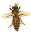
European honey bee—15mm