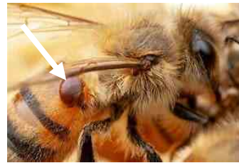
The varroa mite (arrow) under the wing of a worker

Understanding Varroa mite and its impacts The importance of monitoring and thresholds Integrated Pest Management and Varroa mite Chemical treatment options including organic options Brood location, frame rotation and management. Good record keeping and more!