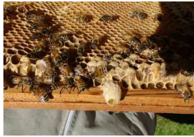
Swarming queen cell