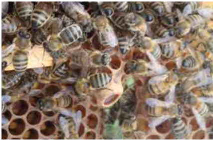
Queen play cell