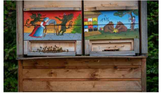
Painting apianes is a traditional art form in Slovenia.

Slovenia, a Central European country of two million inhabitants, over 11,000 of whom are beekeepers — the highest amount per capita in Europe. With its own indigenous Carniolan honey bee and over 230 years of beekeeping tradition — Anton Janša, the first beekeeping teacher at the Habsburg court, is considered a pioneer of modern beekeeping — Slovenia is a world leader in the field.