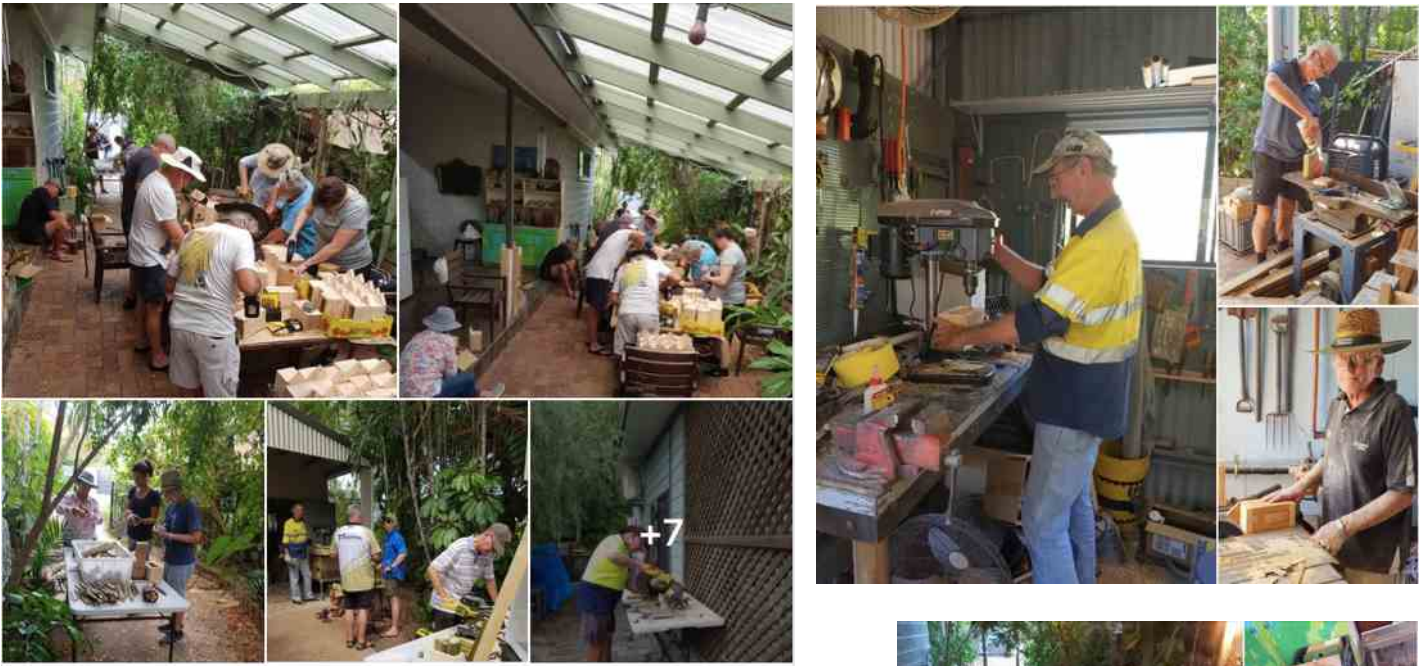
And some of the output – ready for painting