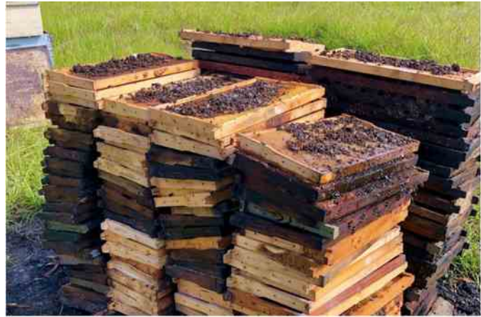
Hundreds of honeycomb frames infected with small hive beetle will be burnt.