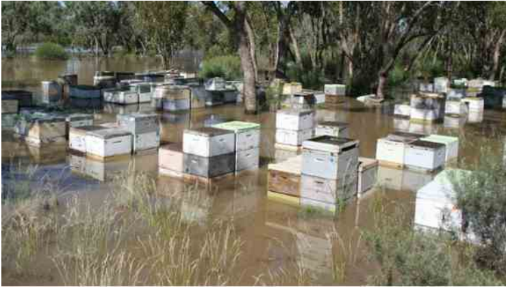
Around 6,000 beehives across the Mid North Coast have been destroyed.